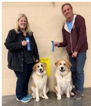
Sunny and Stormy